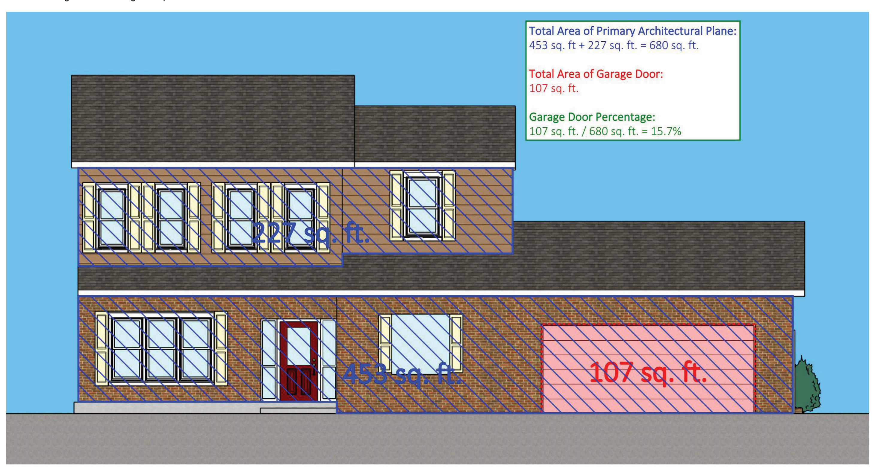
Exhibit 1 - Garage Door Percentage Example Calculation